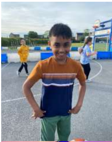
Some snaps from our Year 3 Sleepover.