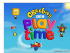
youtube.com Cbeebies Playtime - be: