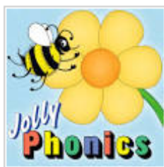
itunes.apple.com Jolly Phonics Letter

Some Apps are free, some are free up to a point and some are prepay.