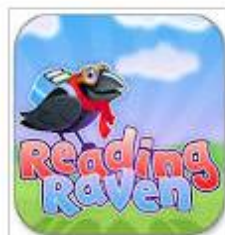
brightstarbedtimestori. READING RAVEN | Le