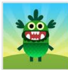
itunes.apple.com Teach Your Monster to Read on the App Store