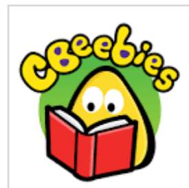
amazon.co.uk BBC CBeebies Storytime: